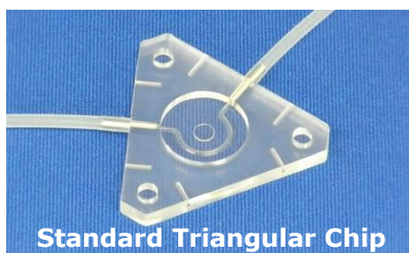
Standard Triangular Chip

*2: The input power supply of the controller RE-C100 is 100VAC (50-60 Hz).